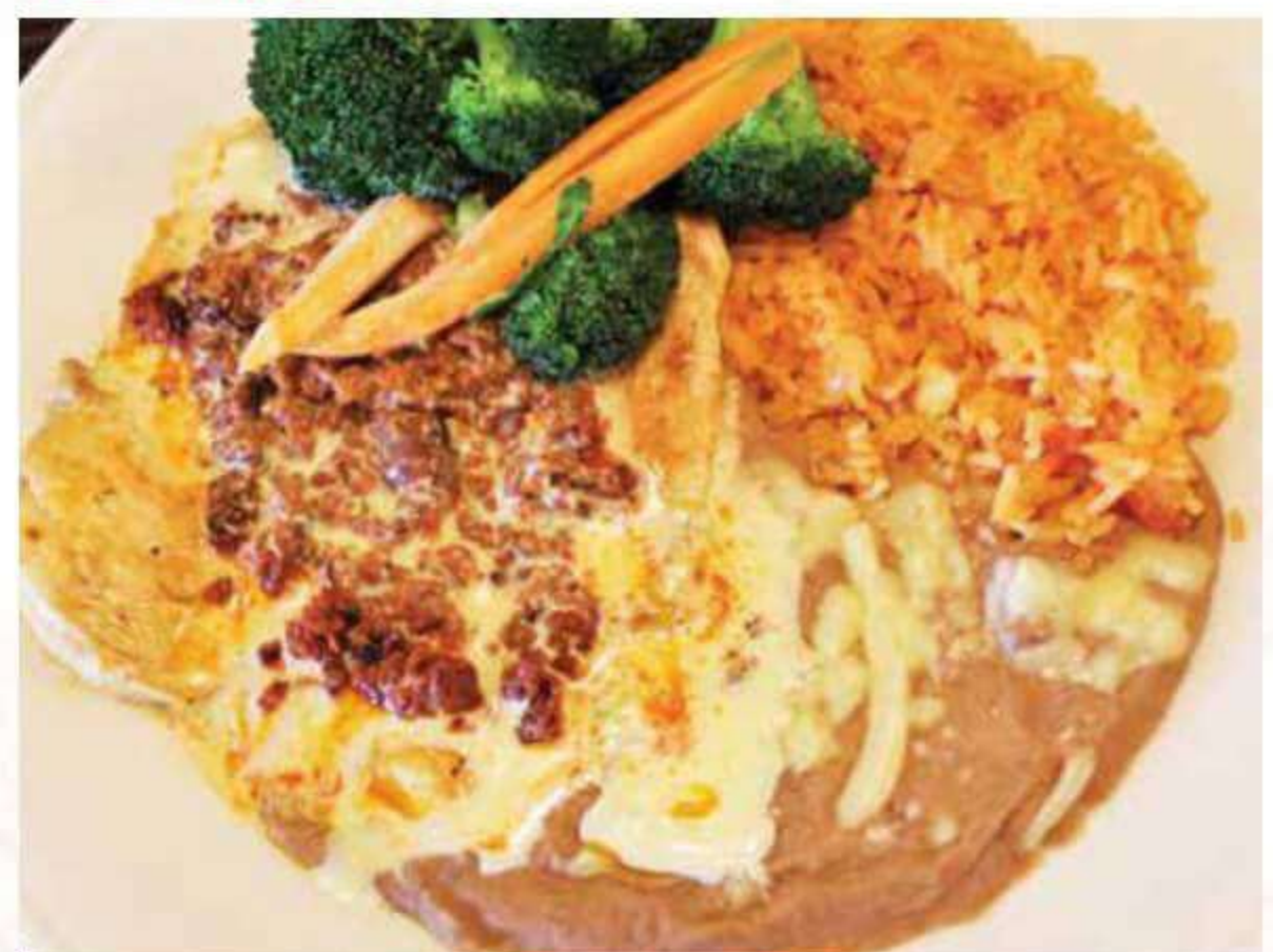
POLLO CON CHORIZO

*WARNING: CONSUMING RAW OR UNDERCOOKED FOODS SUCH AS MEAT, POULTRY, SEAFOOD, SHELLFISH OR EGGS MAY INCREASE YOUR RISK OF FOODBORNE ILLNESS.