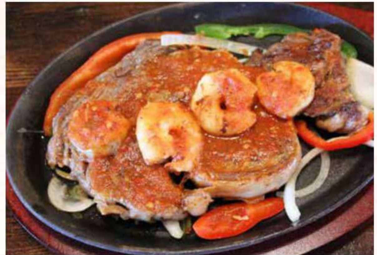
STEAK CON CAMARÓN