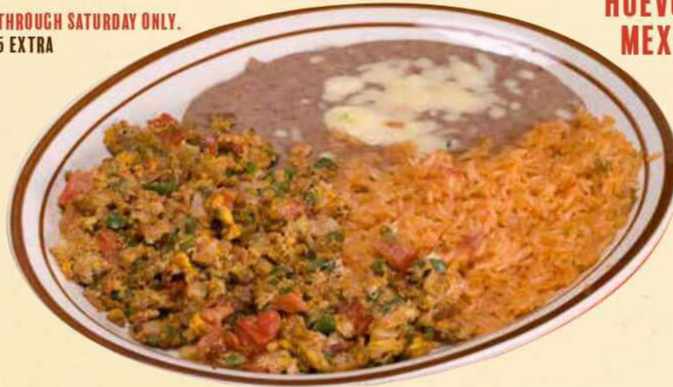
HUEVOS A LA MEXICANA